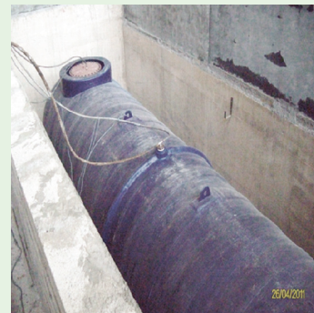
TANK UNDER PRESSURE & VACUUM TEST